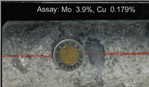
High grade molybdenum – REE potential

Shares issued: March 31, 2019 Shares Issued: 15,054,433 Fully diluted: 17,398,184